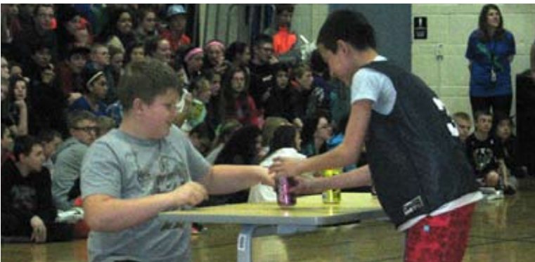
RMS students participate in a PBIS (positive behavioral interventions and supports) event.