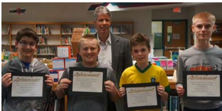
The Board of Education recognized students that won the district spelling bee and qualified for the regional spelling bee.