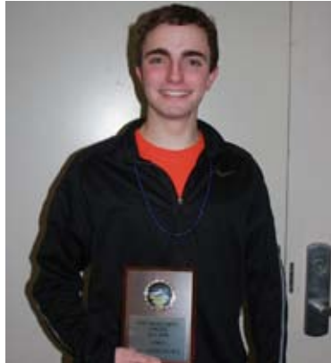
A RHS/Lumen Math Team student was honored with being named to 1st Team All-Conference during a recent Math Meet. 22 members of the Ripon Team participated in the meet and took 3rd place in the small school division.