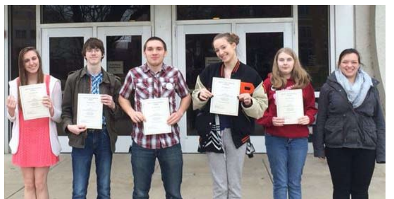
Congratulations to RHS/Lumen students who participated in both the regional and state German Pronunciation and Speaking contest. Six students qualified for the state contest and won two 3rd place, two 2nd place and one 1st place finish.