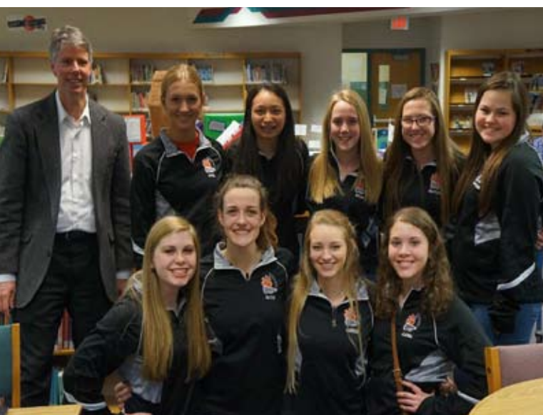
The RHS Cheer and Stunt Team was honored by the Board of Education for their 4th place finish at the recent State Cheer Competition.