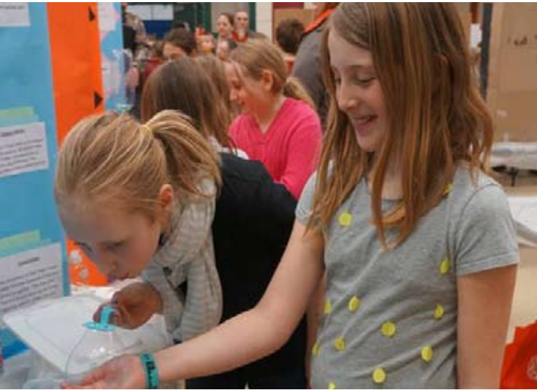
Murray Park and Quest students participated in the annual Science Fair to share their conclusions using the scientific method of problem, hypothesis, experiment, observation, and conclusion. 159 students presented and used display boards, demonstrations, and explanations to highlight the results of their research and compared it to their hypothesis.