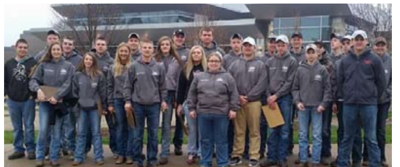
24 FFA students traveled to UW-Platteville to compete in seven areas including Meat Judging, Agronomy, Horse Judging, Wildlife, Livestock Judging, Agricultural Mechanics, and Dairy Cattle Judging. Several students placed in the top 15% of their areas, with the horse team scoring the highest with 5th place. The Meats, Agronomy, and Horse teams will be competing at State in Madison on April 29.