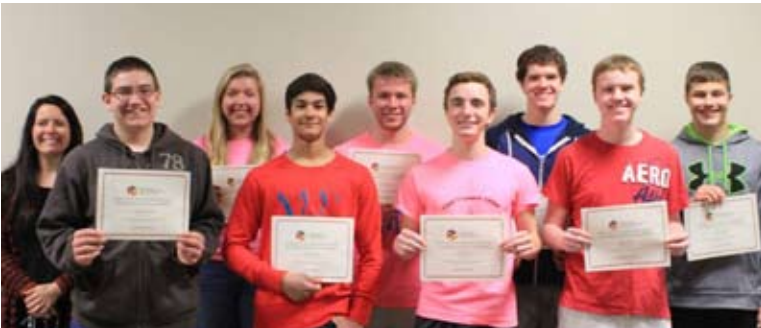
The RHS/Lumen Math Team competed in the State Mathematics Contest in March (sponsored by the Wisconsin Mathematics Council). The eight-member team took Second Place in the Class B Schools! In addition, three Ripon students earned the honor "2016 All-State 1st Team Class B" by being among the top scores individually from that category.