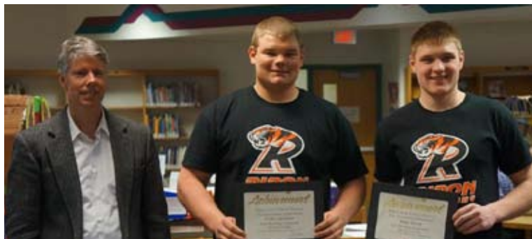
Two members of the RHS Wrestling Team were congratulated for both placing 6th in their weight class at the State Wrestling Tournament.