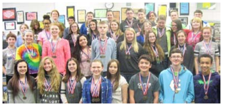
RMS/Catalyst 7th and 8th grade choir students participated in the Solo and Ensemble Festival recently. They had the opportunity to demonstrate their musical skills in front of a judge, peers and parents as they were judged in five categories. This was an excellent event for students to gain confidence and grow in their musical abilities.