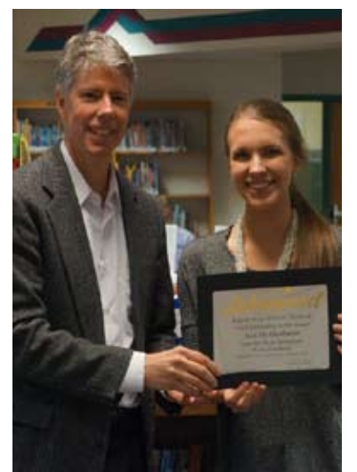
A Ripon student was honored by the Board of Education for recently having her works displayed at the State Art Exhibit.