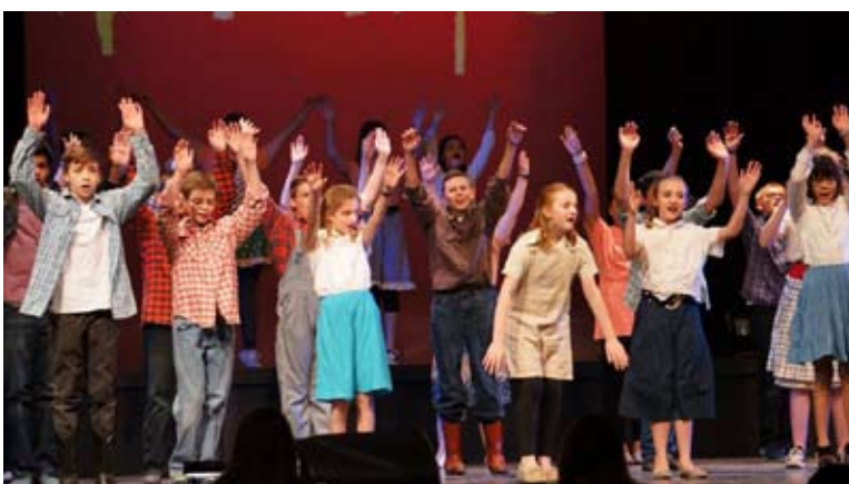
RMS students entertained audiences with a energetic rendition of the musical Footloose.