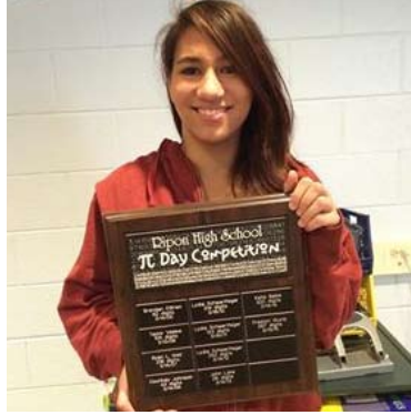
The RHS Math Department held the 2016 Pi Day Competition on March 14 (Pi Day). This year's winner recited 411 digits of PI. She broke the previous record of 300 which was set in 2014. The second place student recited 301 digits and third place finished with 255 digits.