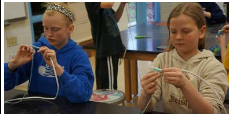
Murray Park students working on a weaving project in Art class.