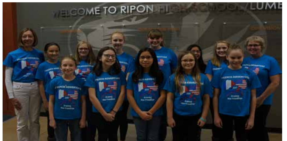
The students who participated in the French Adventure program during April and May 2017 were recognized by the Board at the November meeting. The Ripon community was the home to twenty seven French elementary students.