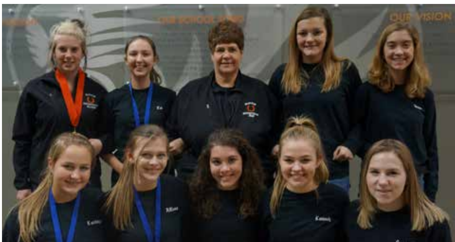
The RHS Equestrian Team was recognized at the November Board meeting for earning the Wisconsin Interscholastic Horsemanship Association (WIHA) Championship at State Finals. They competed against 11 other teams in their Division and finished with a total 156 points, an impressive 36 points above the 2nd place team.