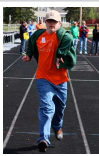
Ripon High School hosted Friendship Day on Wednesday, May 14. 11 schools participated in the track and field event.

Seven students and two teachers joined 2,500 others at the 15th annual White Privilege Conference in Madison. This is the third time the RASD has sent faculty and students to the WPC, the premiere racial justice conference in the nation. With hundreds of workshops, daily keynotes and a dynamic youth program, the 3-day event was unforgettable for all who attended. Attendance was funded by grants and donations.