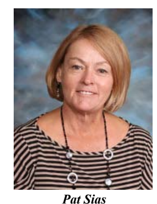
(25 years) School Psychologist