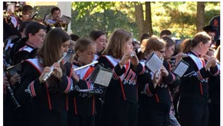
RHS band members have been rehearsing for the Veterans Day Program on November 11 at 10:45a.m. in the Ripon Middle School gym. The public is invited to attend.

Based on the Department of Revenue October 2, 2014 certification of equalized value, the equalized value of property in the Ripon Area School District increased by 3.16%. As a result, the referendum impact originally stated as an increase of $123 per $100,000 of property values will be $119 per $100,000 (see the updated tax impact chart in special referendum section). The Department of Revenue's certification of equalized value is a reflection of new construction, comparable sales of property, and economic change. This is different from assessed values that are determined by local assessors in each community.