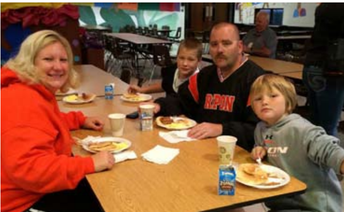
The RHS/Lumen team served a record number at the annual Homecoming Breakfast this year. The breakfast is an annual tradition serving community members, students, and families.