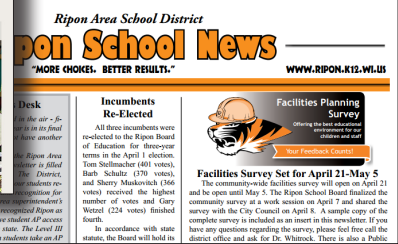
Receiving State Superintendent Tony Evers recognized Ripon as a Level III Pacesetter School for impressive student AP scores and excellence in AP exam scores in the state. The Level III distinction denotes that over 10% of Ripon students take an AP