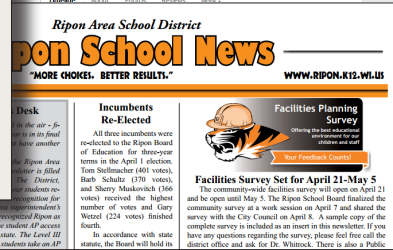
Receiving State Superintendent Tony Evers recognized Ripon as a Level III Pacesetter School for impressive student AP scores and excellence in AP exam scores in the state. The Level III distinction denotes that over 10% of Ripon students take an AP