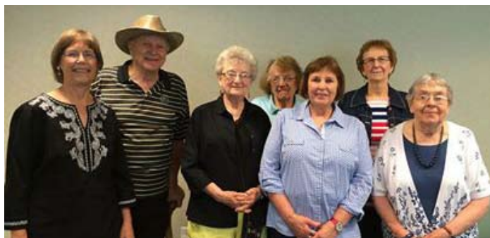
Seven of this year's STEP (Senior Tax Exchange Program) volunteers took a moment to be honored for over 1,000 volunteer hours contributed during the past year. STEP volunteers can earn a $425 annual credit for their property taxes by volunteering in the schools. Eligibility criteria include being at least 62 years old, a Social Security recipient, and property taxpayer in the District.

A Community Engagement session is planned for June 18 at 6:30 p.m. in RHS room 167. As the process continues, the District will be meeting with city officials, staff, and hosting another Board Workshop on July 14. If the Board votes to proceed to referendum, the deadline for the Board to approve the resolution is August 18.