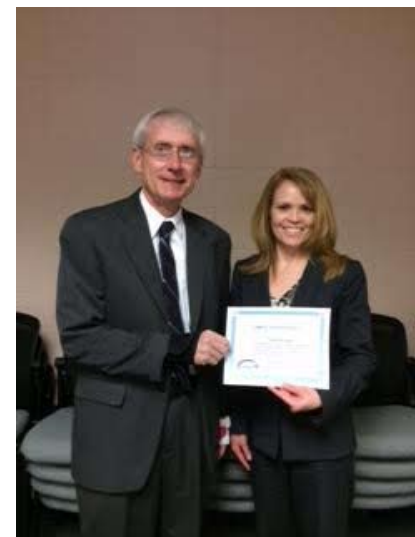
Ripon High School was recognized as an Advanced Placement (AP) Level III Pacesetter school by State Superintendent, Tony Evers.