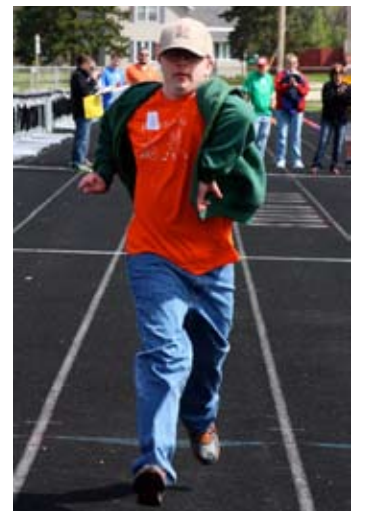
Ripon High School hosted Friendship Day on Wednesday, May 14. 11 schools participated in the track and field event.

Seven students and two teachers joined 2,500 others at the 15th annual White Privilege Conference in Madison. This is the third time the RASD has sent faculty and students to the WPC, the premiere racial justice conference in the nation. With hundreds of workshops, daily keynotes and a dynamic youth program, the 3-day event was unforgettable for all who attended. Attendance was funded by grants and donations.